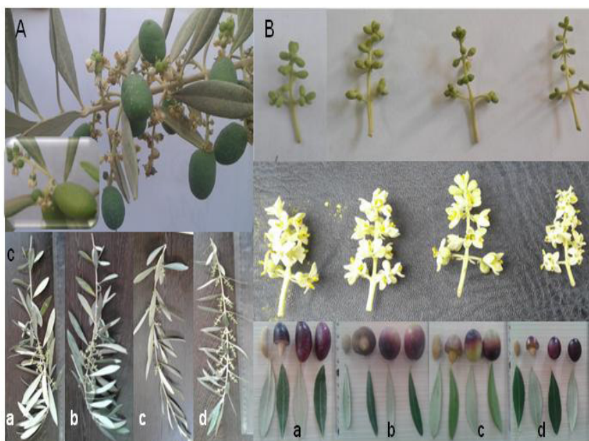
Fig. 3. Flowering, fruiting in four olive cultivars: a- 'Dolci', b- 'Maraki', c- 'Carotina' d- 'Koroneiki'. A) 'Maraki' cultivar's fruit growth variation. B) Inflorescence, fruit, seed C) One year old shoot